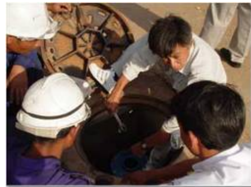
Water Supply Improvement in Phnom Penh, Cambodia