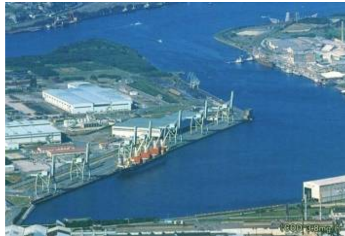
Recovered Blue Skies and Sea, people enjoying environment

Corroded boat propeller and E. coli bacteria died.