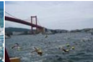
Swimming at Dokai Bay

Kitakyushu was introduced by the OECD's Environmental Report as “from Grey City to Green City” in 1985.