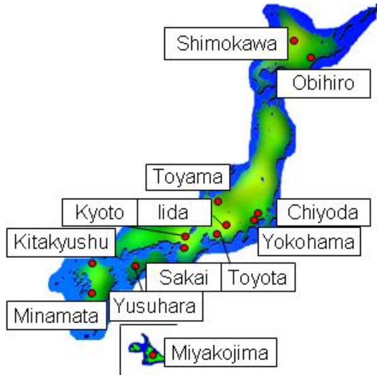
13 EMCs around the country