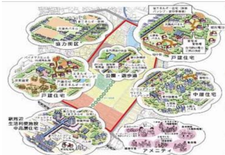
Zero Carbon Emission Town Development (Jono Area)