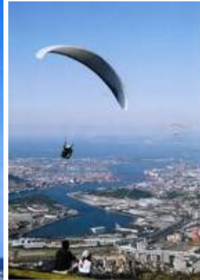
Citizen enjoying blue sky