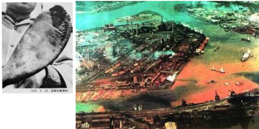
“The Dokai Bay, Sea of Death”

Corroded boat propeller and E. coli bacteria died.