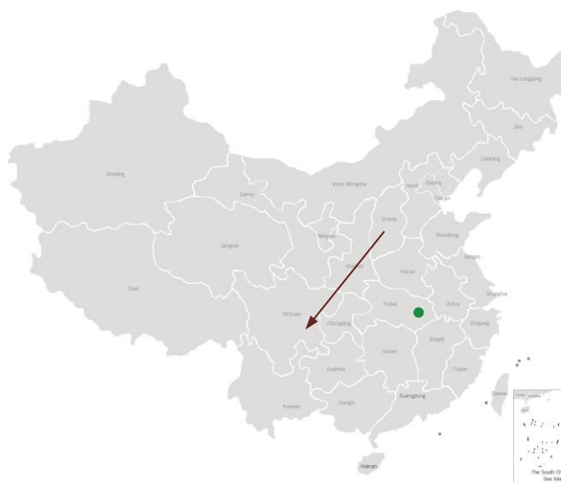
Wuhan, Hubei province

As an economic center and mega city in China's central region, with its particular geography and climate, Wuhan has long been an energy-intensive city. However, given its high dependency on energy imports and increasingly severe environmental constraints, it is inevitable that it will adopt a low-carbon development path.