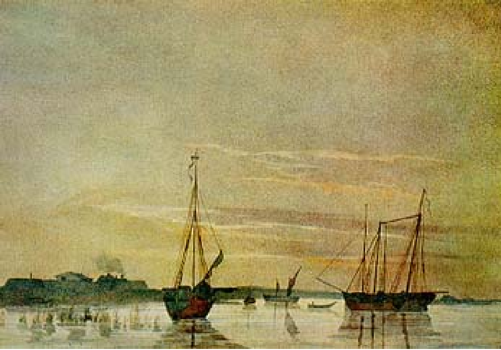
Taras Shevchenko sketch 1848 Aral Flotilia