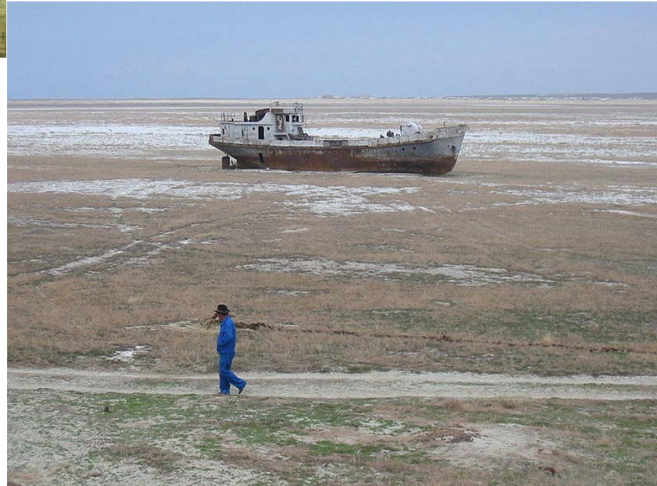
Abandoned ship in former Aral Sea