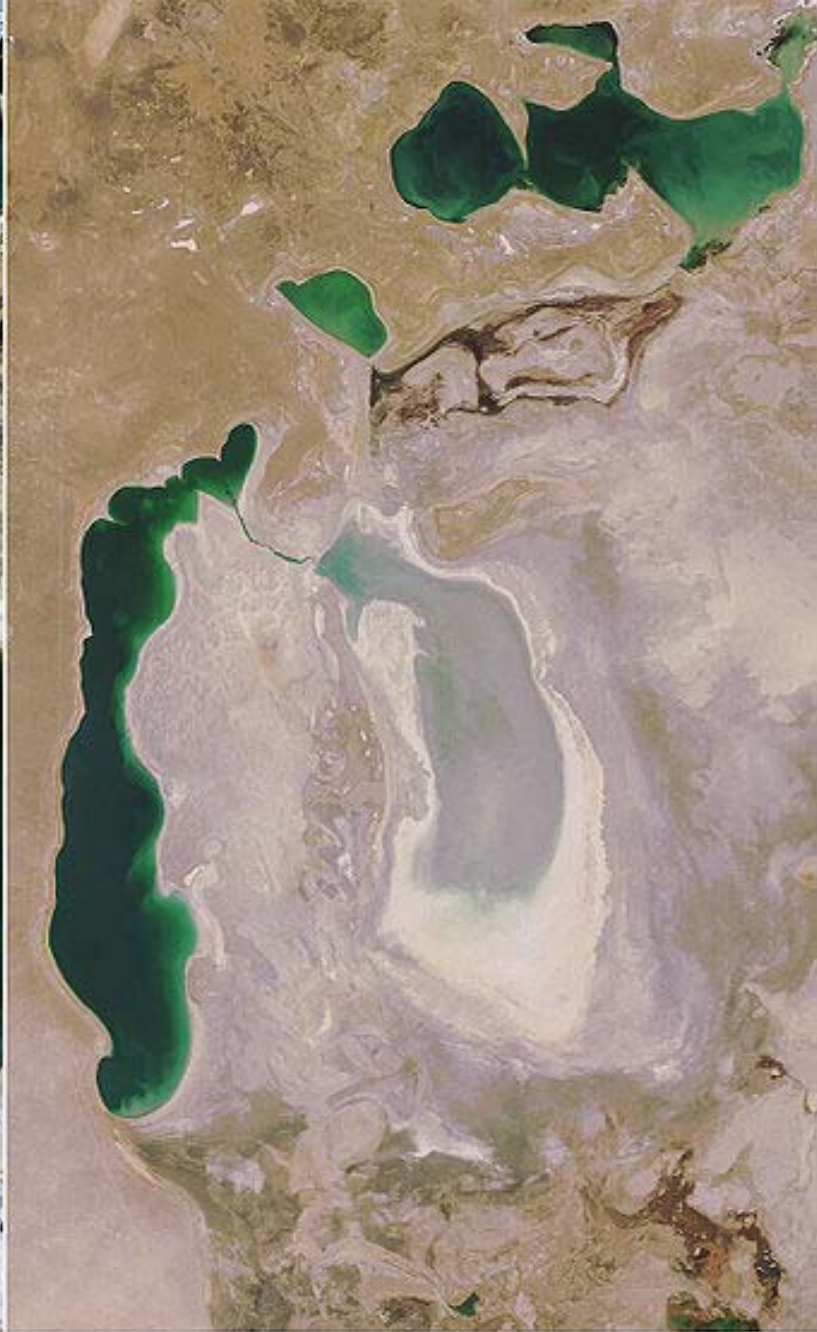
October 5, 2008