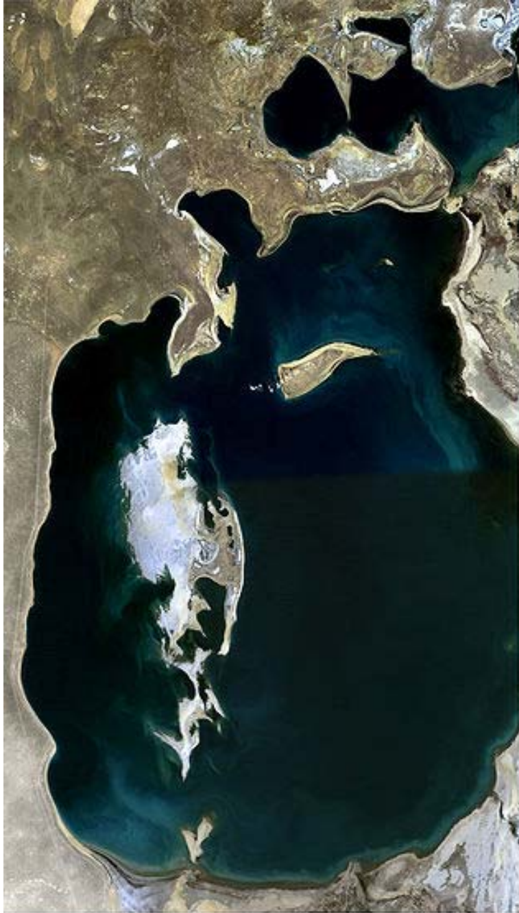
July - September, 1989