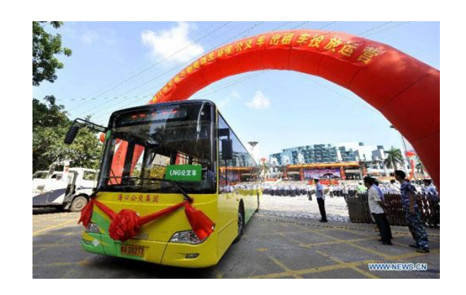
Eco-bus in Haikou

Hainan set its goal of reducing 12% energy consumption in the 11<sup>th</sup> Five Year Economic Plan period while its GDP grows at the rate of 10%.