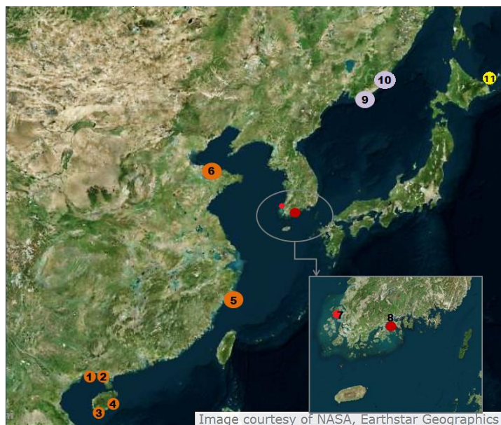
Table 1. NEAMPAN Sites

7. Currently, member States have nominated a total of 11 sites as NEAMPAN member sites, including six sites from China, one from Japan, two from the Republic of Korea, and two from the Russian Federation as shown in Table 1 below.