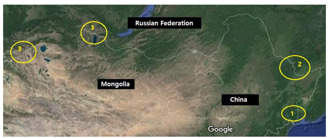
Figure 1 Target study areas of the project

** Note/ 1. TLNP + LLNP; 2. Lesser Khingan Mountain areas; and 3. Chikhachev ridge (left) and Eastern Sayan ridge (right)