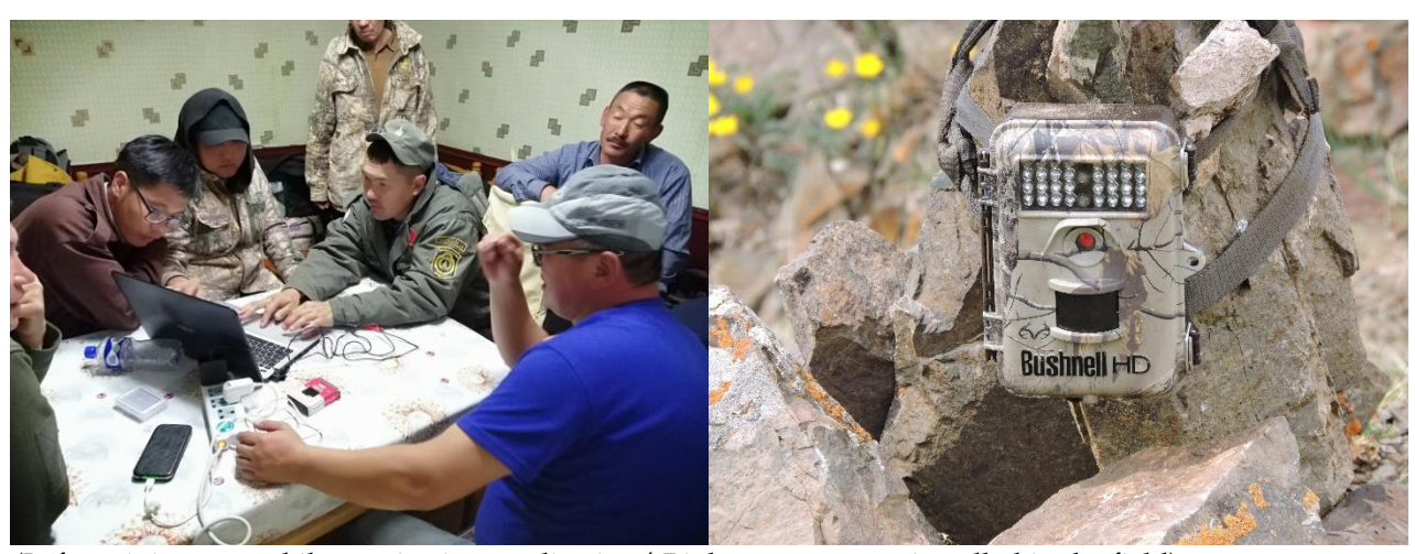
(Left: training on mobile monitoring application/ Right: camera trap installed in the field)

13. The Project component 3 has started since mid-May 2020. Upon the agreement, two implementing partners organized inception meetings, respectively, to train experts on how to set up camera traps in the field and use the standardized snow leopard monitoring application. The mobile application was originally developed in Russian language and is now available both in English and Mongolian. Camera traps have been set up in target areas, and data will be collected and analyzed by the end of 2020. A project report including comparative analysis of camera trap data and priority action plans for a follow-up project will be presented in March 2021.